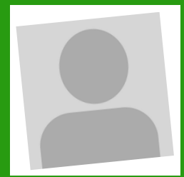
NEEDED Treasurer or 2!