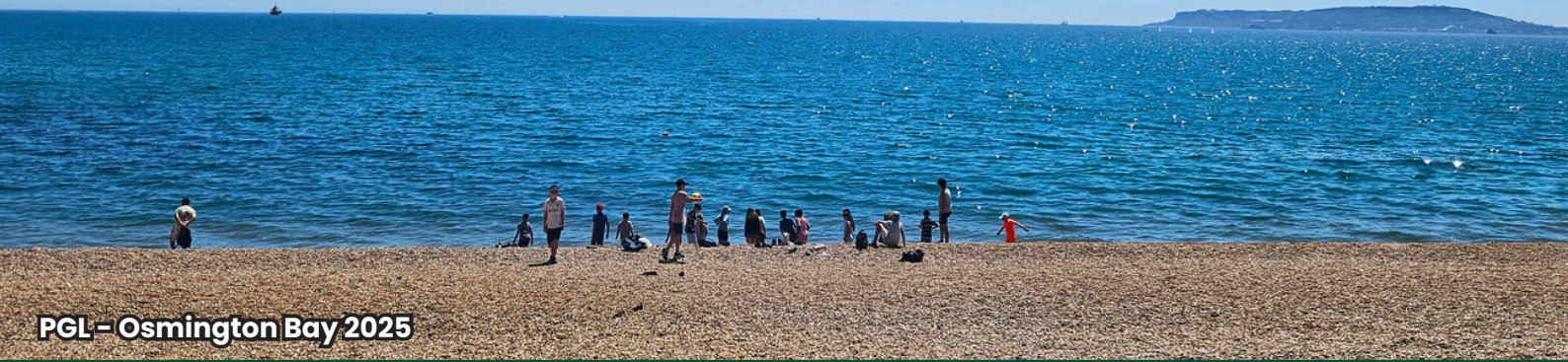
PGL – Osmington Bay 2025