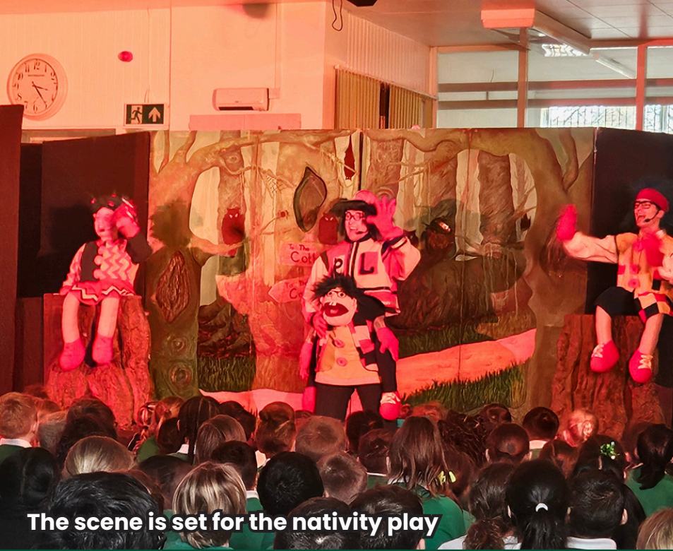
The scene is set for the nativity play