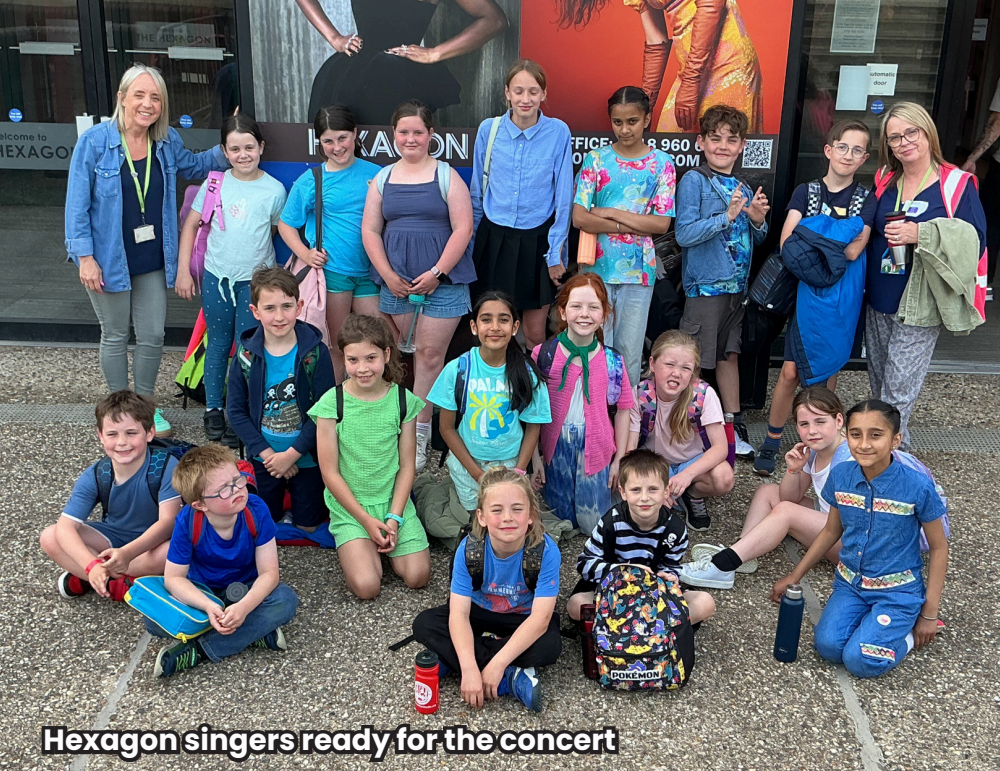
Hexagon singers ready for the concert