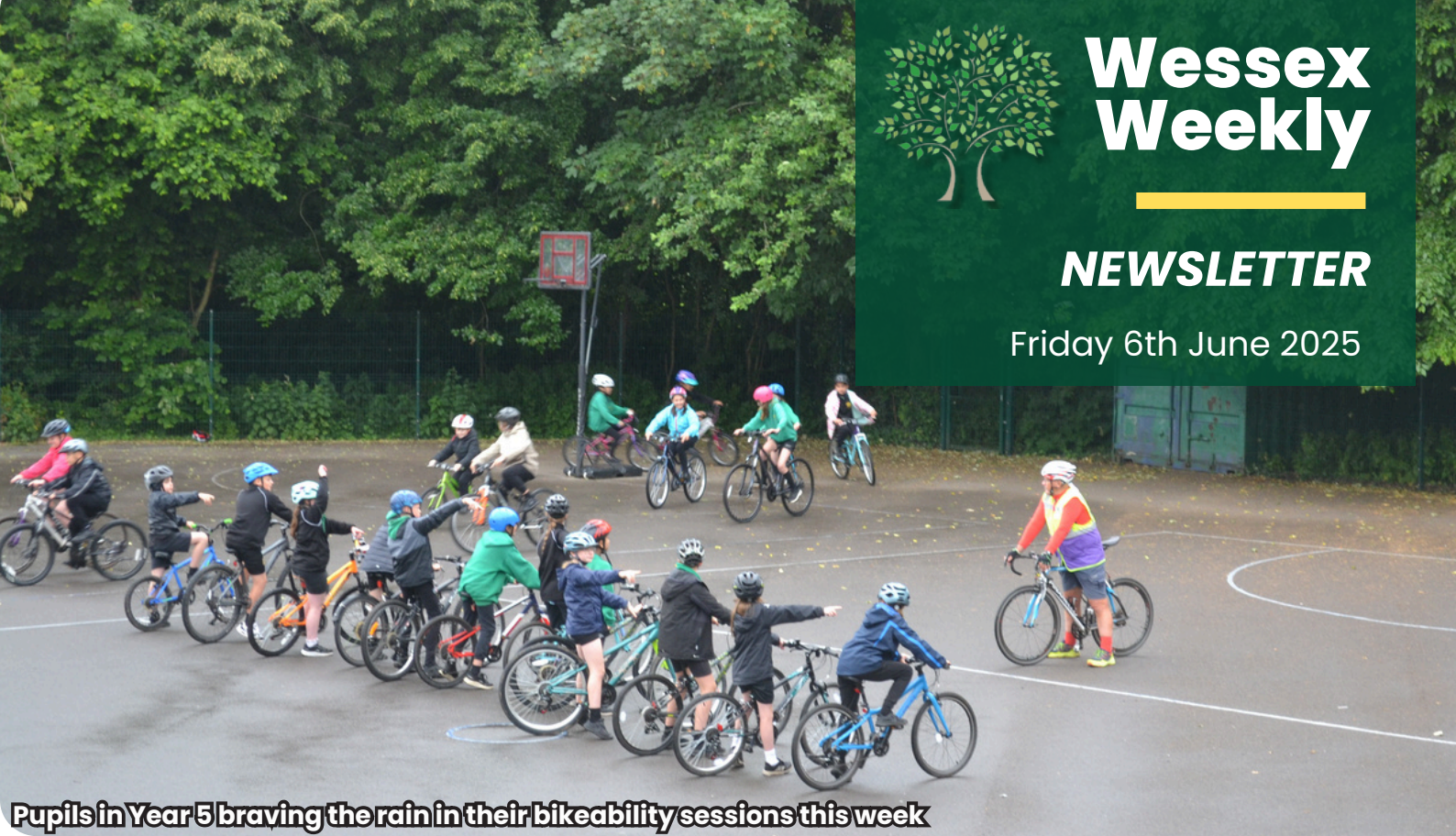
Pupils in Year 5 braving the rain in their bikeability sessions this week