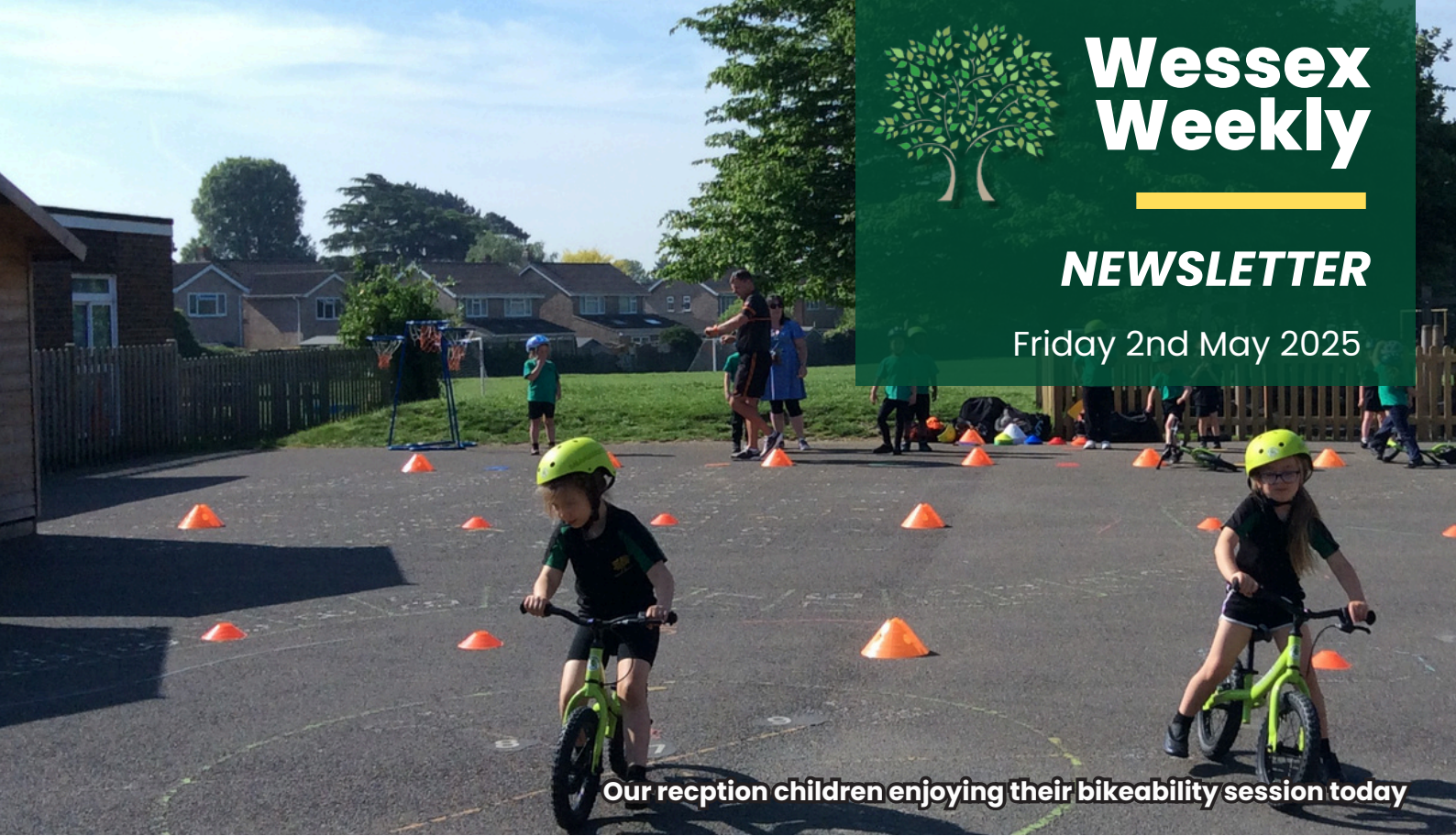
Our reception children enjoying their bikeability session today