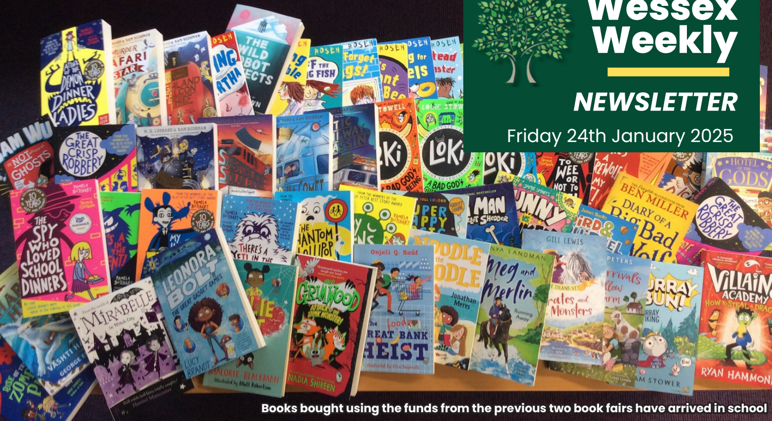
Books bought using the funds from the previous two book fairs have arrived in school