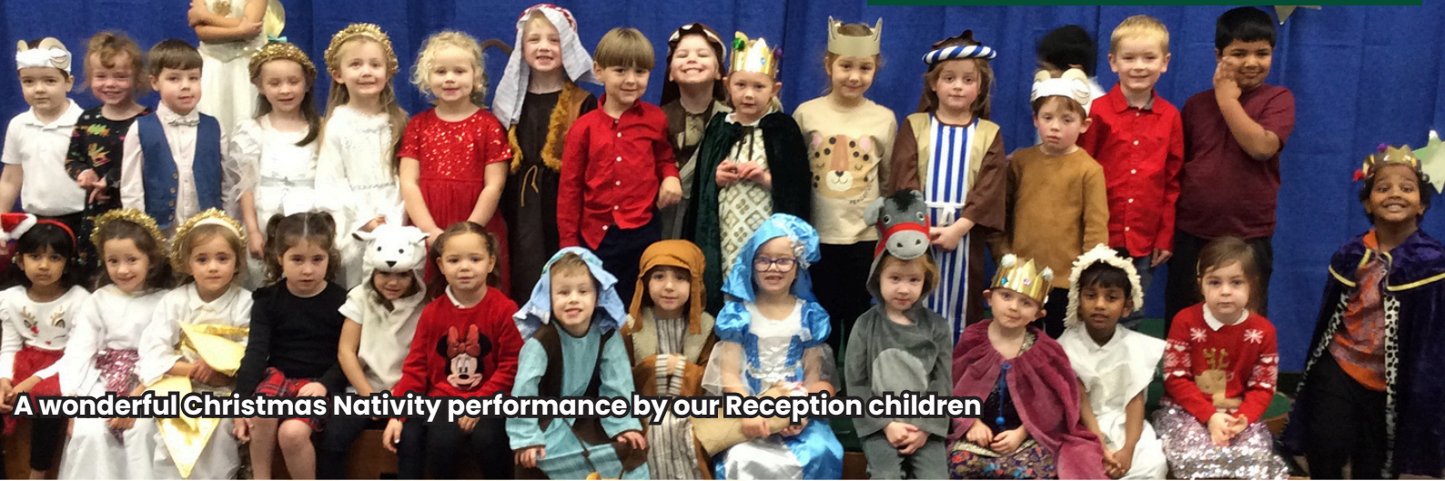
A wonderful Christmas Nativity performance by our Reception children