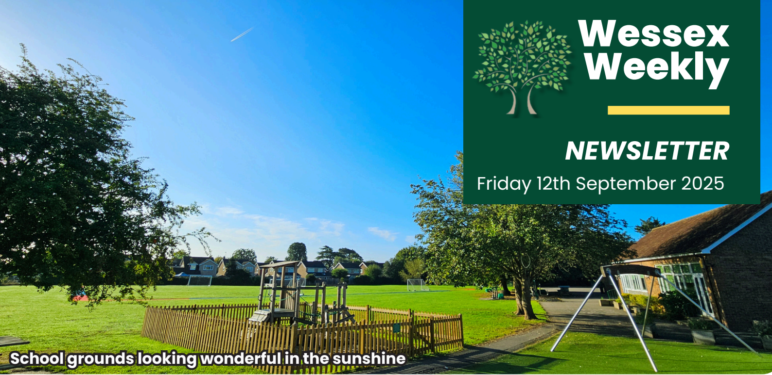
School grounds looking wonderful in the sunshine