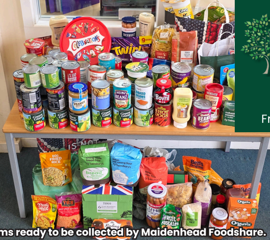
Harvest items ready to be collected by Maidenhead Foodshare.